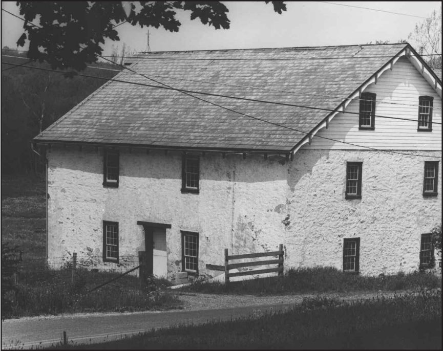
Ackland Mill, Chester County, Pennsylvania, date unknown. Mormon missionaries performed baptisms at the mill, which suggests that this was the location for Edward Hunter's baptism.