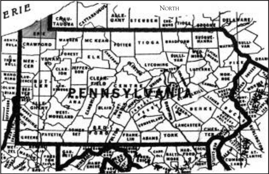
Pennsylvania County Map Eighth Edition of the Handy Book for Genealogists