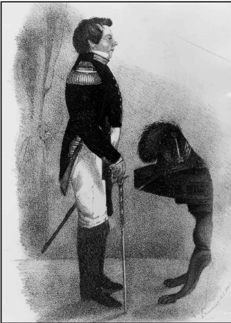
Lt. Gen. Joseph Smith. Painting is by Sutcliffe Maudsley, ca 1842.

The houses at first were constructed of wood, and many of them of logs, not less than a thousand being erected within three years; while, in imitation of the old French villages, each was surrounded by its own yard and garden. The population rapidly increased, until it reached some 15,000 or 20,000 souls, large numbers of the new proselytes being the fruit of the preaching of Mormon missionaries among the poorer classes, the small farmers, and the operatives of the manufacturing towns of Great Britain, who, oppressed at home, were probably quite as much converts to the new land of promise, as to the new faith. Of this thriving capital, Smith was prophet, priest and king—the mayor and the autocrat. He was, also, the chief publican, the chief store-keeper of the place; and