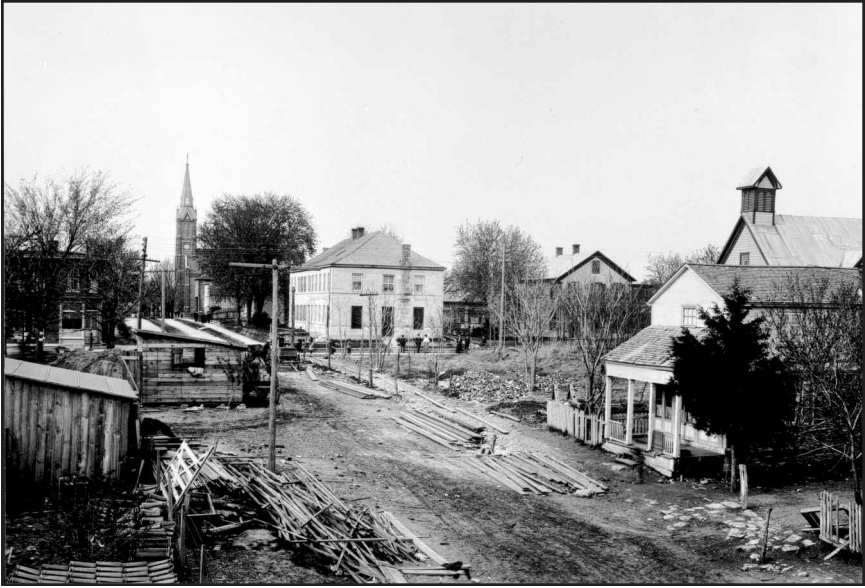
Nauvoo Temple Block, In the center of the picture is the two-story Icarian schoolhouse, built of Nauvoo Temple stones.

The men are said to number nearly two hundred, with women about seventy, and the children forty or fifty, and all are, apparently, happy and content, especially the two latter classes. Their diet is exceedingly simple, consisting chiefly of soup and bread, which is partaken of twice a day by the whole community, summoned by a trumpet to the long pine tables on which the simple repast is spread. A press has been established, from which issue two weekly papers, one in the German language and one in the English, but none in the French; a large school-house has been constructed of ruins of the Mormon temple; a brewery, a distillery, a saw-mill, a grist-mill, a library, a theatre, a cabinet of physic and chemistry, and a small arsenal of hunting guns have been established, and some twenty acres of land have been put in cultivation for vegetables. Game is plentiful, and so are fish; and boats and nets have been constructed for the capture of the latter.