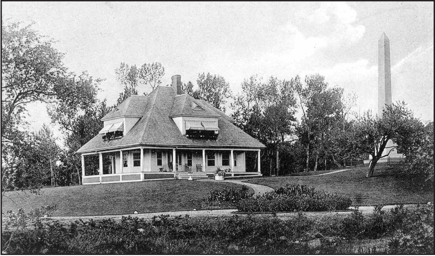
This postcard shows the Memorial Cottage and Monument in the cultivated resort setting, complete with flowers and lily pond.