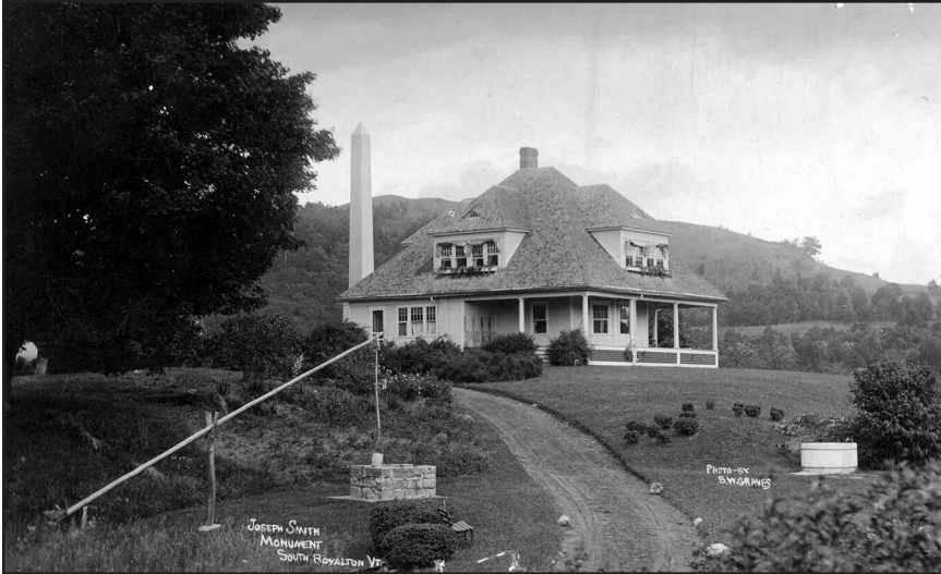
The Smith family well, in the foreground of this postcard, served as one of the living, tangible unities with the past.

Courtesy Royalton Historical Society, Royalton, Vermont.