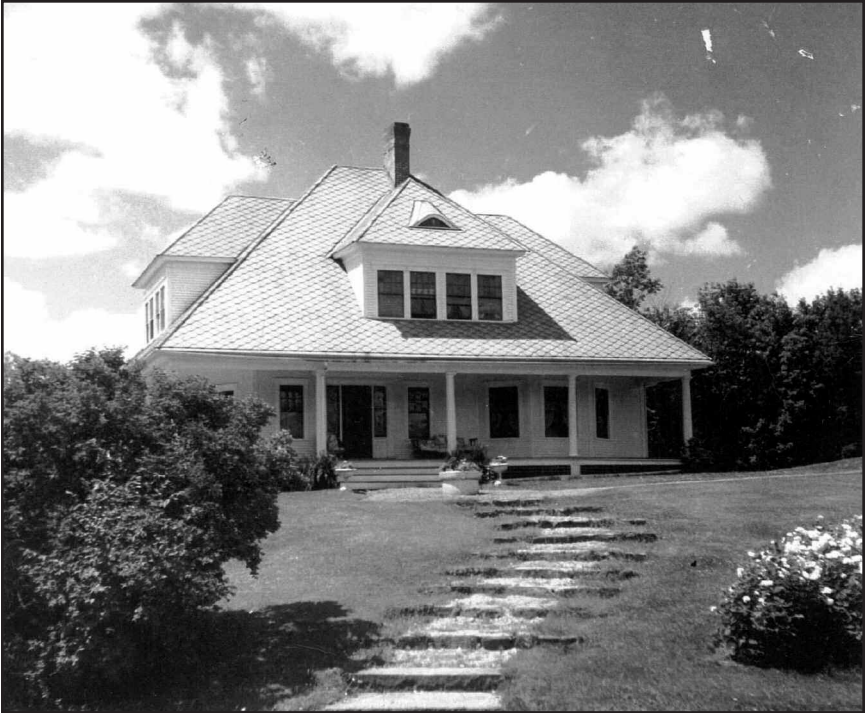
The Joseph Smith Memorial Cottage, 1920s.