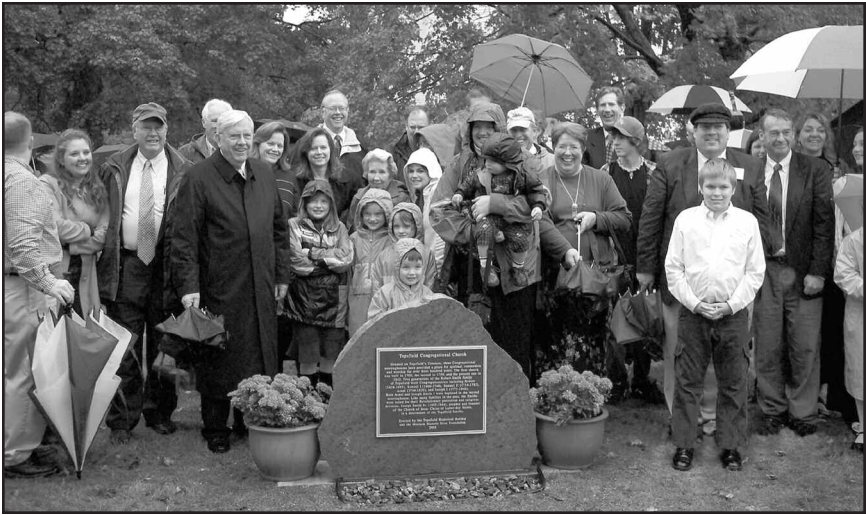
Topsfield Congregational Church marker dedication, Topsfield, Massachusetts, 16 October 2005. Elder M. Russell Ballard of the Quorum of the Twelve Apostles and a Smith descendant, participated in the dedication activities.