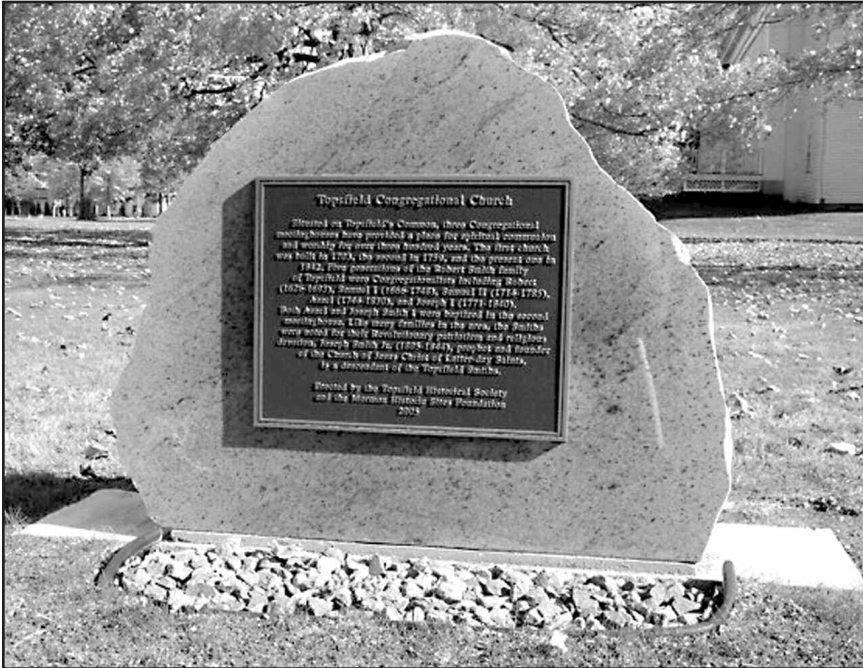
Topsfield Congregational Church marker, Topsfield, Massachusetts, October 2005. The marker describes the religious and patriotic heritage of Topsfield's early settlers, including five generations of Joseph Smith's ancestors. The placement of the marker was done by the Topsfield Historical Society and the Mormon Historic Sites Foundation in cooperation with the Topsfield Congregational Church.

Erected by the Topsfield Historical Society and the Mormon Historic Sites Foundation, 2005.