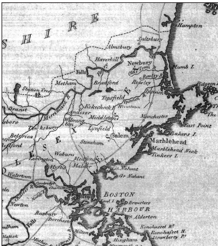
Portion of an early map of northeastern Massachusetts published in The American Atlas (1796), showing the community of Topsfield, situated twenty-five miles northeast of Boston. Five generations of Joseph Smith's ancestors lived in Topsfield. Asael Smith, grandfather of Joseph Smith, left Topsfield with his family in 1791, marking the end to over a century and a half of Smith family history in the community.

tions of the Topsfield Smiths. The warmest feelings of collegiality and mutual regard attended the occasions. There now stand two historical markers that will aid future visitors to Topsfield in understanding the contribution of the five generations of Smiths who resided there.