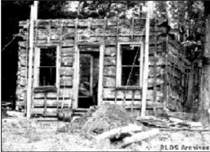
Charles C. Rich/James Wallace Log House Five miles south of Far West, Caldwell County, Missouri

Rich built the house about 1837. Wallace came to the house about 1842; a partial stone foundation and additions were probably added by him. The Missouri Mormon Frontier Foundation, organized to collect and preserve information from the 1830s period in Mormon Missouri, has completed three years of archeological investigation at the site. Further work is scheduled in the future. For more information on this project and others sponsored by the MMFF, see their website at http://www.sunflower.org/~ronromig/mmffhp.htm .